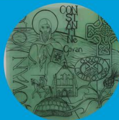
PAINTED GLASS FEATURING GOVAN OLD AND THE ANCIENT RELIGIOUS HISTORY