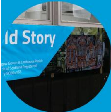
PUBLICITY LOCATED AT OUR ENTRANCE