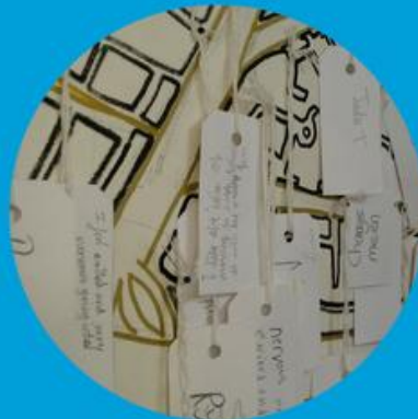
MAP OF GOVAN DISPLAYING PEOPLE'S FEELINGS ABOUT CHANGE, AND CHANGE IN GOVAN