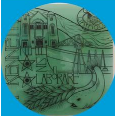
PAINTED GLASS FEATURING LINTHOUSE ST KENNETH'S AND THE INDUSTRIES OF GOVAN