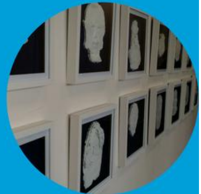
FACES OF GOVAN CLAY WORKS BY LOCAL FAMILIES