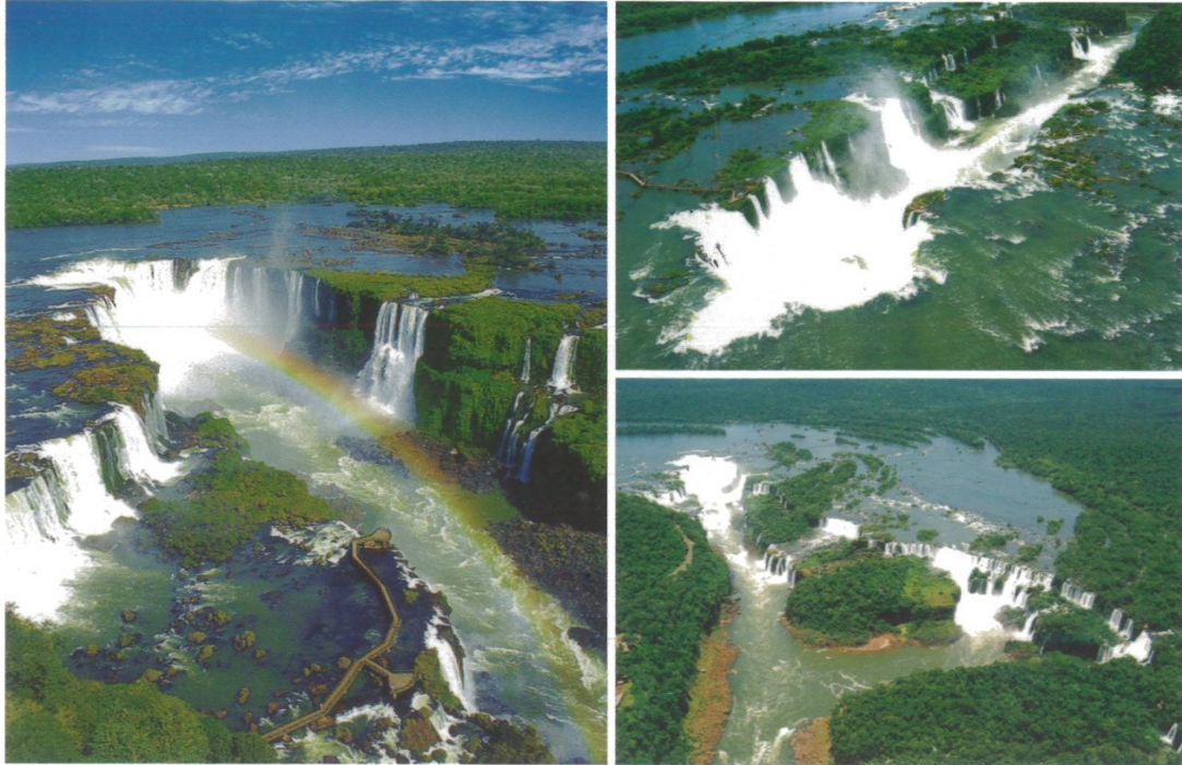
Cataratas do Iguazu - Brasil